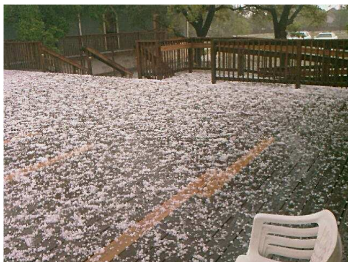
Hail on the Lord of Life Deck during the big hail storm. We were so fortunate that no windows were broken.

Coming Soon to our Website: A photo gallery