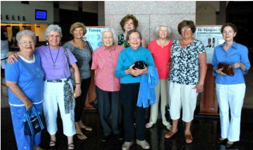
The group had a nice lunch at the café in the museum.

Kindred Sisters went to the Bob Bullock Museum here in Austin in July and toured the special exhibit: The Forgotten Gateway: Coming to America Through Galveston Island